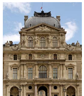
All these landmarks are served by district energy systems such as those operated by The Hartford Steam Company.